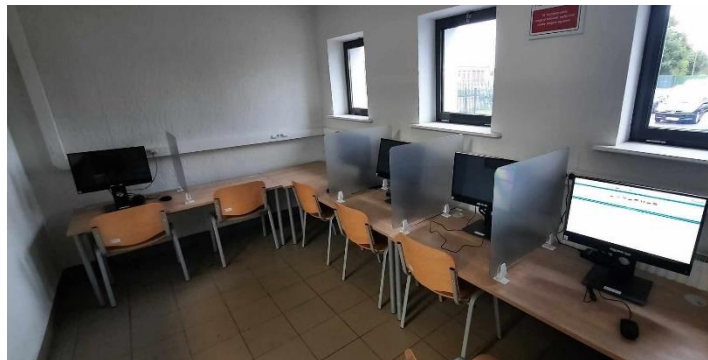
PC stations Gate No. 2.

1. The Mondi OHS certificate exam is conducted at computer stations located at the entrance gate to the premises of plant no. 2 (gate by the office building).